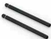
Balance Rail Pins

Lightweight Rockwell hardness tested anodized aluminum parts for durability and performance