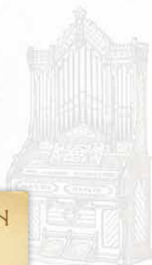
BEST ORGAN (WITH PIPE TOP)

WITH THEIR Improved Method of Stringing.